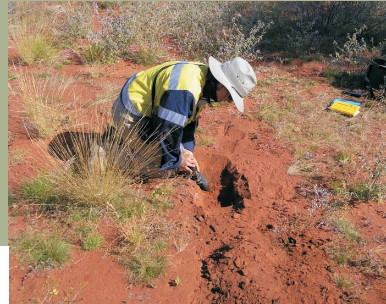
Soil sampling in the Tanami

Corner Jerrabomberra Ave and Hindmarsh Drive, Symonston, Canberra ACT 2609